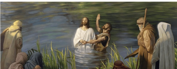
"Permit it at this time"

But Jesus answering said to him, "Permit ( aphiemi ) it at this time - Permit is a command in the aorist imperative meaning do this immediately! Jesus did not have to be baptized, but choose to be baptized.