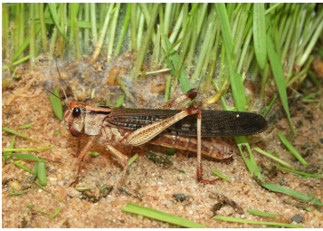
A Yummy Wild Locust

And his food was locusts and wild honey - John's diet was nutritious and the price was right in the wilderness. Click the locust above to make him big and somewhat intimidating. I wonder if John ate " kosher locusts ?" Leviticus had put the stamp of approval on locusts declaring "These of them you may eat: the locust in its kinds, and the devastating locust in its kinds, and the cricket in its kinds, and the grasshopper in its kinds." (Lev 11:22+) One commentator says modern Bedouins still wear camel hair garments and eat locusts (grasshoppers). Wild honey could be found in abundance, made by the wild bees who nested in the clefts of rocks and in the trees of the valley. Honey is mentioned several times in the OT (Gen 43:11; Exod 3:8; Deut 32:13; Jdg 14:8; 1 Sam 14:25; Ps 81:16; Ezek 27:17)