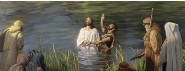
"Permit it at this time"

But Jesus answering said to him, "Permit ( aphiemi ) it at this time - Permit is a command in the aorist imperative meaning do this immediately! Jesus did not have to be baptized, but choose to be baptized.